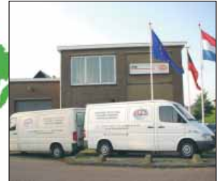
Service Teams Worldwide