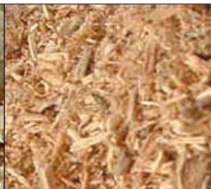
After Hammer Mill