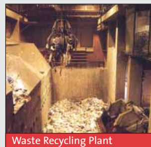
Waste Recycling Plant