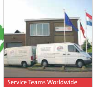
Service Teams Worldwide