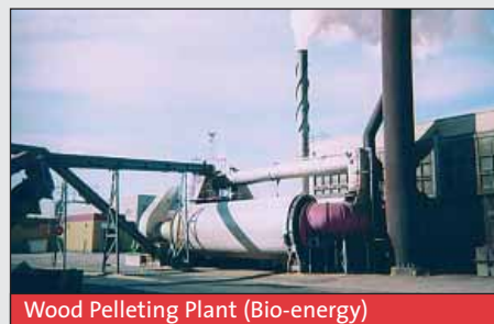
Wood Pelleting Plant (Bio-energy)